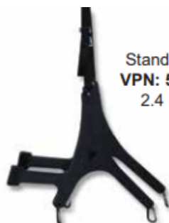
Stand-Offs VPN: 55711 2.4 lbs