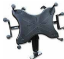
Tablet Holder VPN: 55720 1.71 lbs