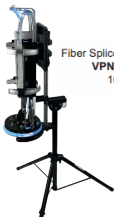
Fiber Splice Case Stand, VPN: 55712 10 lbs