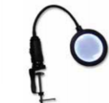
LED Dual Power Light with Magnifying Glass, VPN: 55615 1.45 lbs