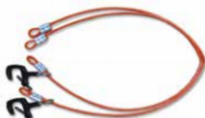
Aerial Strand Cables, VPN: 55715 1 lb