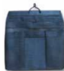
Black Poly-Mesh 3-Pocket Pouch, VPN: 55710 .15 lb