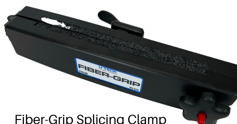
Fiber-Grip Splicing Clamp VPN: 55755 1.6 LBS