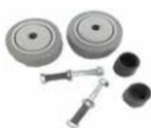
Wheel Kit VPN: 55740 10 oz