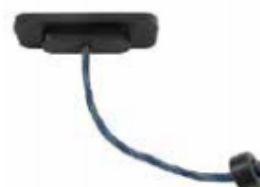
Splicer Seat Tether VPN: 55745 5 oz