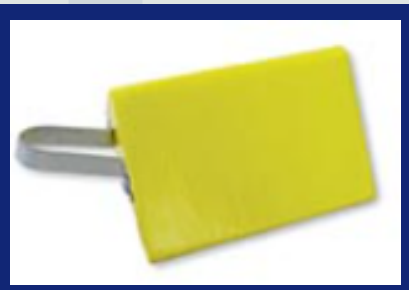
Hardwood Wheel Chocks