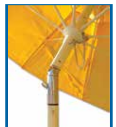
Sturdy-Tilt Locking Hinge