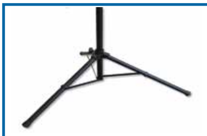
Adjustable Tripod Stand