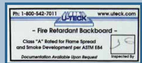
Class Rating Label Sample

Every U-TECK Fire-Retardant Backboard comes with this Class "A" rating, along with the Class Rating Label affixed to each board! That makes ours the safest backboards available in the market today!