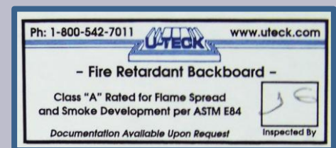
Class Rating Label Sample

Every U-TECK Fire-Retardant Backboard comes with this Class "A" rating, along with the Class Rating Label affixed to each board! That makes ours the safest backboards available in the market today!